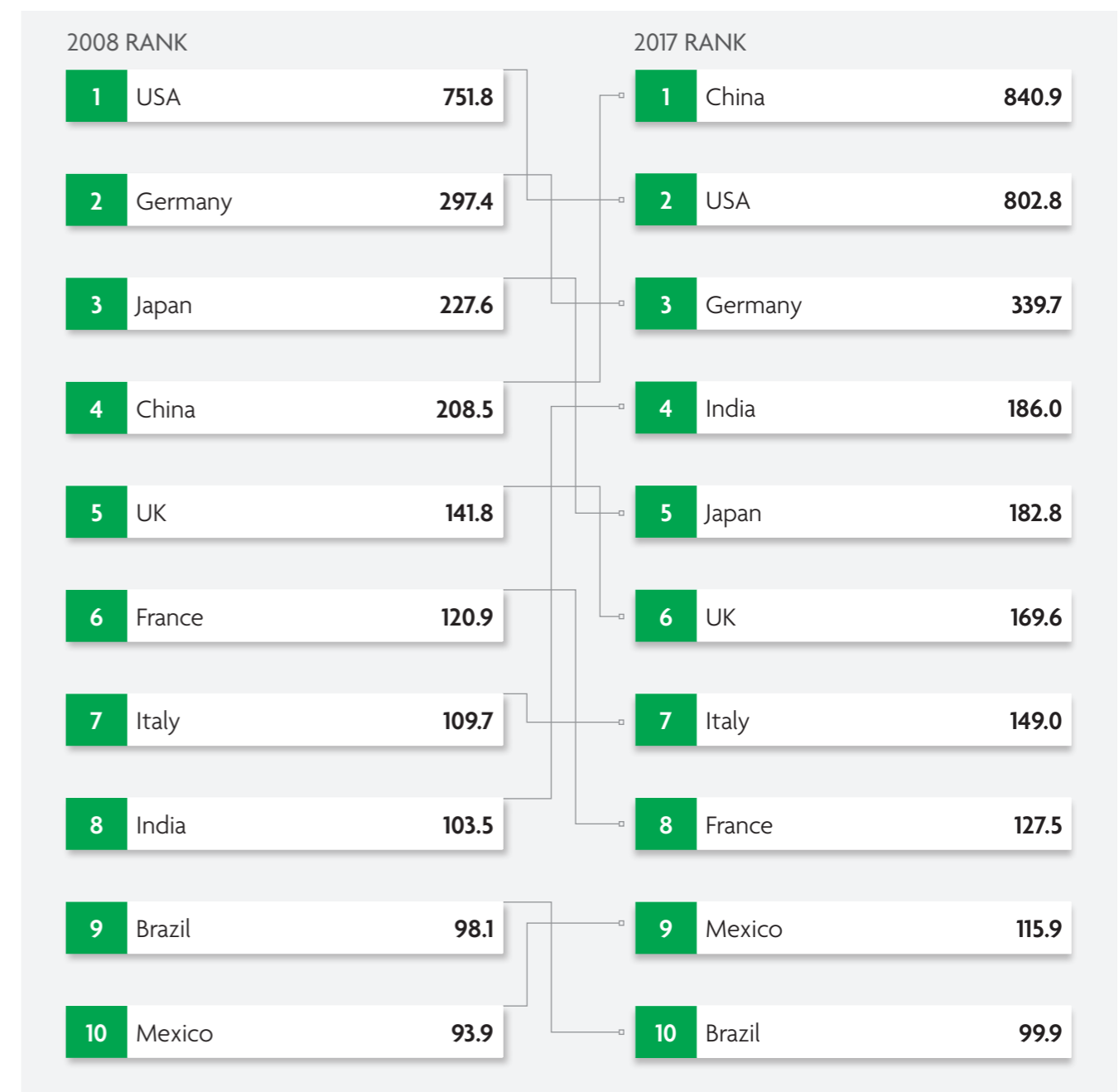
Chart 1: Countries’ positions in domestic visitor spending (2008 and 2017) (Travel & Tourism Domestic Spending, in 2017 US$bn real prices)

Germany ranked third in domestic spending in 2017 with US$340 billion, nearly double the amount of India and Japan, which came fourth and fifth with US$186 and US$183 billion respectively. It is worth noting the rapid development of the domestic Travel & Tourism market in India, which grew by US$83 billion and rose from the eighth to the fourth largest domestic market between 2008 and 2017. Unsurprisingly, the largest developed countries dominate the top spots in terms of absolute size of domestic spending.